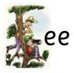
What can you see?