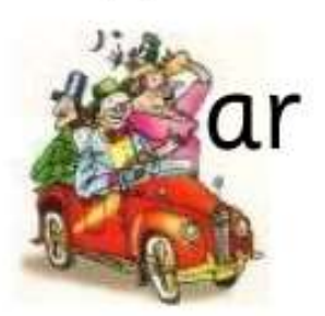
Start the car