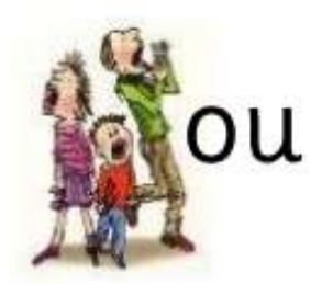
Shout it out