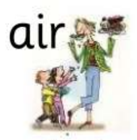
That's not fair