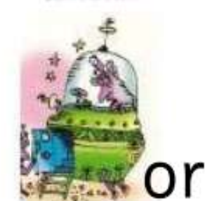
Shut the door