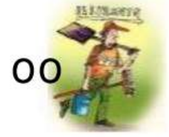
Poo at the zoo